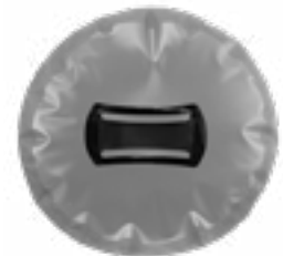
Base loop for holding and easy emptying