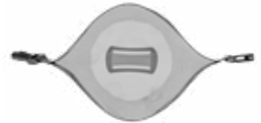
Inside of dry-bag

Indication of volume in liters on fabric