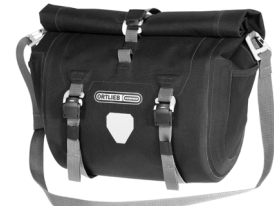
Handlebar-Pack Plus with carrying strap