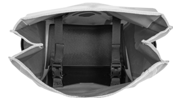
inner Compression Straps