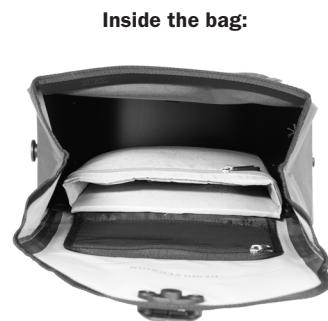
Inside the bag: