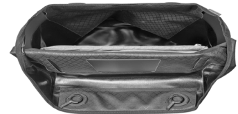
Interior view with laptop compartment