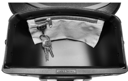
Carabiner with key chain

Handlebar mounting-set (sold separately):