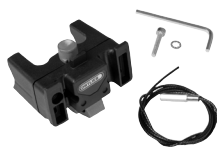
E225 Handlebar Mounting-Set