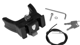
E207 Handlebar Mounting-Set E-Bike with Lock