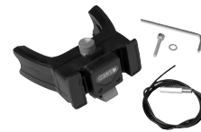
E226 Handlebar Mounting-Set E-Bike