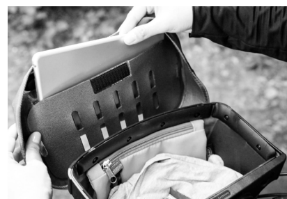
Opening lid compartment: 20,5cm / 8.1in.