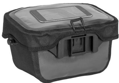
Smartphone in transparent lid compartment (not included)