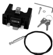
E185 Handlebar Mounting-Set with Lock