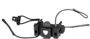
E241 Handlebar Mounting-Set QR

Handlebar mounting-set (sold separately):